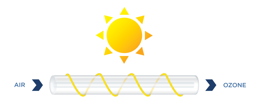
Dual wavelength patented UV lamp, simulating the sun