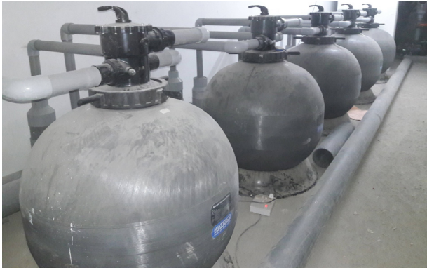
Micron Fibreglass Filters S1050