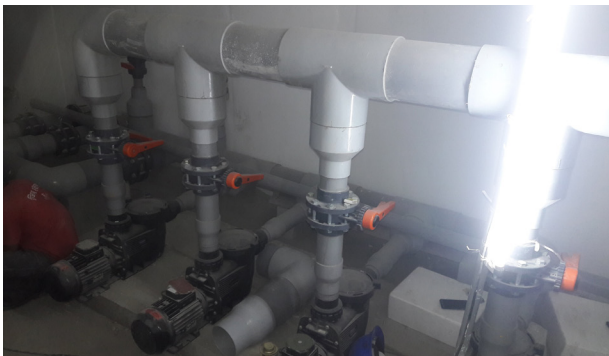
Hydrostar 700 Pumps

To begin with, 5 units of Waterco's Micron S1050 Fibreglass Filters were set up. Equipped with multi-layers of media filters, the Micron Fibreglass Filter does the perfect job of removing waste under stress, given its durable capability and high-performance rate. Its defining feature is the unique, precision-engineered laterals that maximize water flow for efficient filtration and backwashing. Combined with a top-mount design, this ensures easy installation and minimal maintenance.