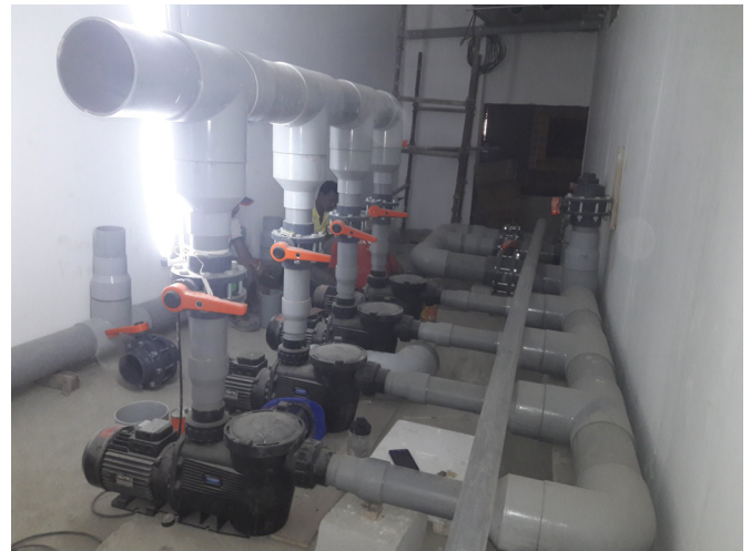
The Tight Plant Room with Limited Space Available

However, there was an obstacle course lying ahead of the installation team. The allocated plant room was down in the basement parking lot, with significantly limited space. At one glance, it seemed almost impossible to fit in all the equipment, much less install it. But that did not deter the team from their efforts, which eventually proved to be worth it. They improvised by arranging the filters and pumps in a neat, parallel fashion, and managed to get the operation up and running in no time.