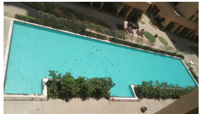
Azziano’s Stunning Swimming Pool